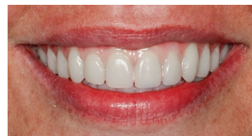
after guided TeethXpress