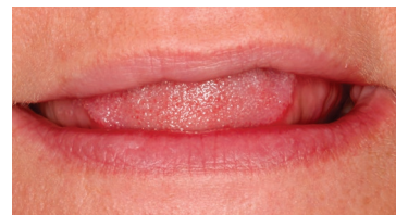
before guided TeethXpress