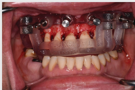
fully guided, digital

comprehensive and foundational full-arch principles & applications