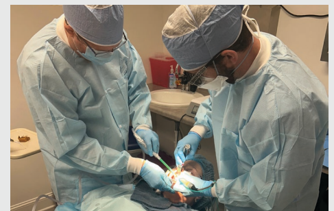
live patient training

advanced digital principles & applications for fully guided full-arch therapy